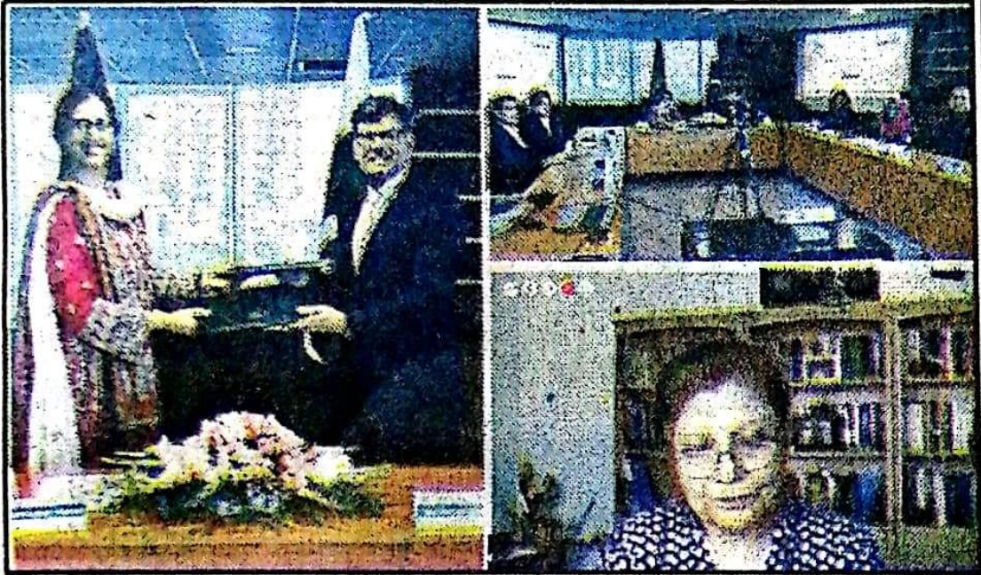
اسلام آباد، سی سی پی اور پی آئی سی جی میں معاہدہ دستاویزات کا تبادلہ کیا جا رہا ہے

اسلام آباد (نامہ نگار خصوصی) لپنیشن کمیشن آف پاکستان (سی سی پی) اور پاکستان انسٹی ٹیوٹ آف کارپوریٹ گورننس (پی آئی سی جی) نے پاکستان میں کارپوریٹ گورننس اور کمپلائنس کی مضبوطی کے لیے تعاون، اشتراک اور معلومات کے تبادلے سے متعلق مفاہمت کی (باقی صفحہ 8 بقیہ نمبر 8)