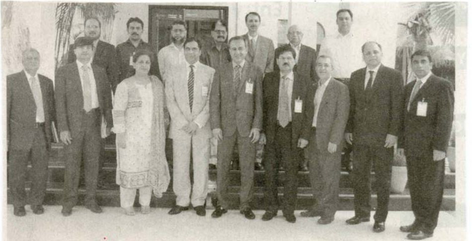
مسابقتی کمیشن آف پاکستان کے سینئر ممبر ڈاکٹر جوزف ڈسن کی صدارت میں مشاورتی گروپ کے 18 ویں اجلاس کے بعد شرکا کا گروپ فوٹو